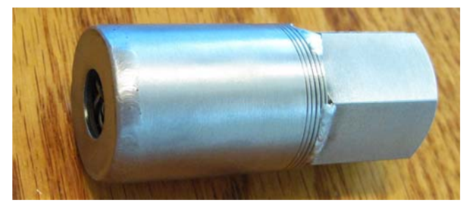
Our port allows venting and will not plug up

After receiving an all-too-familiar distressed phone call last month, we decided to make a test port adapter and give them to anyone who asks. Yes, we are that generous. Plus you may think of us the next time you need a cross-over rebuild. Our top marketing people came up with that one.