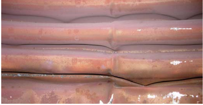
Imploded bellows inner ply with creases that will fail after a few cycles

The two ply testable bellows is supposed to warn you of any inner ply failure so that you can rely on the outer ply and replace the cartridge at your leisure. That does not happen if the cap gets left on. And when an outer ply fails it is panic time. I have seen this happen all too often (I have a file full of imploded Westinghouse failure pics) so that is why this port needs to be leak tested routinely.