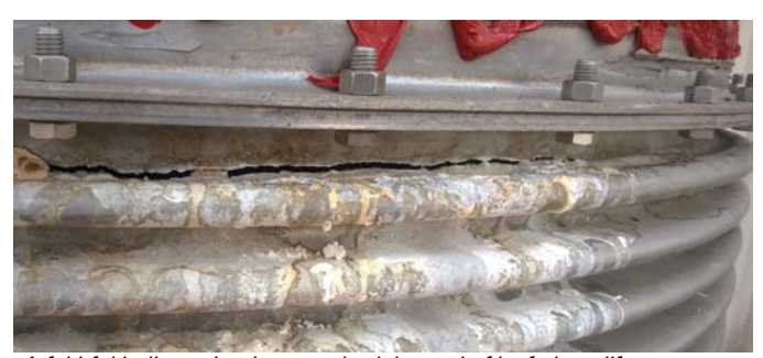
A faithful bellows that has reached the end of its fatigue life

Maintenance engineers should be aware of the location, and age, of existing expansion joints and have a preemptive replacement plan based on typical observed service life for their application.