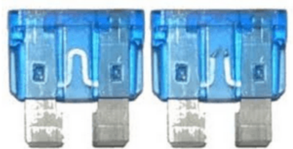
A selfless fuse that took one for the team

Think of a metal bellows as if it was a fuse in an electrical system – the bellows takes all the thermal growth movement so that the piping system and equipment does not; as expected, all that movement will eventually cause the bellows to fatigue and fail.