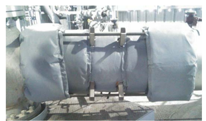
Newly installed limits rods are added insurance

When the pressure is off the system, a lug is bolted on to the back side of the mating flange using the existing bolt pattern.