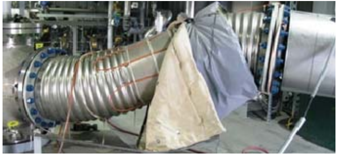
Unsupported pressure thrust extends expansion joint metal bellows

Unexpected pressure spikes can cause anchor failures, which then allows the metal bellows to dramatically extend and trash out all kinds of stuff.