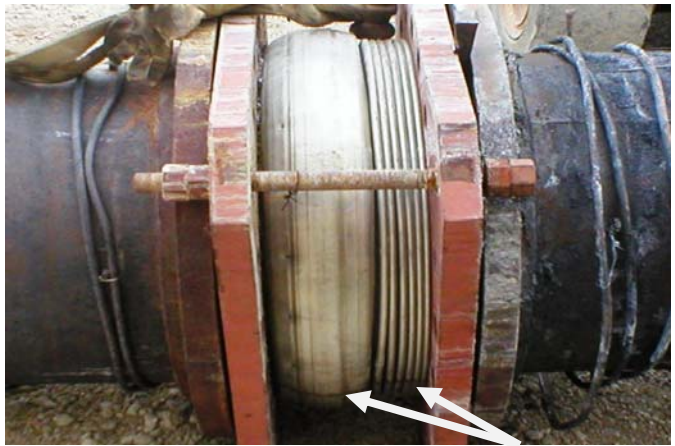
Grossly over-pressurized bellows still does not burst. Note long-seam.

Oh yeah, this is an expansion joint newsletter. OK, here's the application – bellows full penetration longseams get more attention in the ASME code than do the circumferential fillet attachment welds, all for the reasons previously stated.