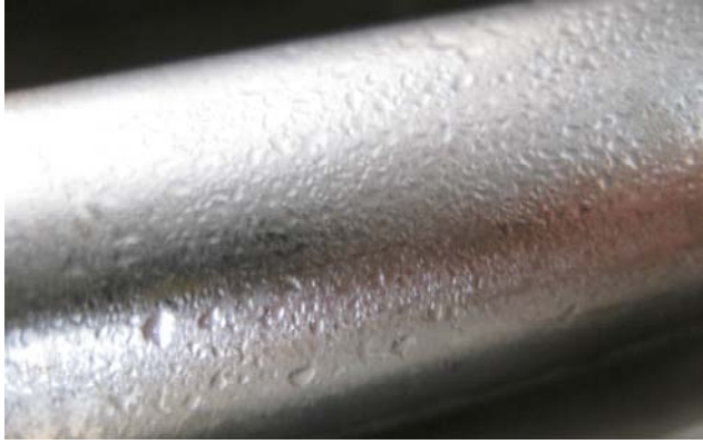
Condensate forming on inside of bellows

In a flue gas system those droplets increase in acid concentrations and eventually corrode the bellows.